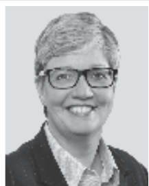
Chris Charlton MP Hamilton Mountain www.chrischarlton.ca